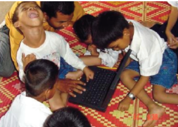
Cambodia.

Gather as a large group. Have each pair share two or three thoughts. Ask everyone: Did any "worst experiences" violate the right to education? How?