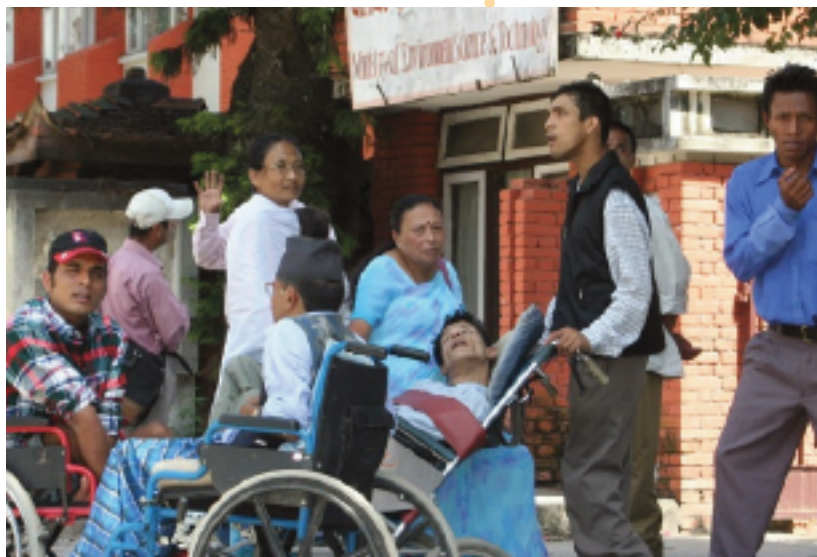
Nepal.

Pass out paper. Ask each person (with support) to draw a picture or write down one law they would like to have to protect their equal rights. Later, ask a local leader to come to your meeting. Each person can show and tell about their idea. Then discuss what laws you do have. Also talk about how to get new ones.