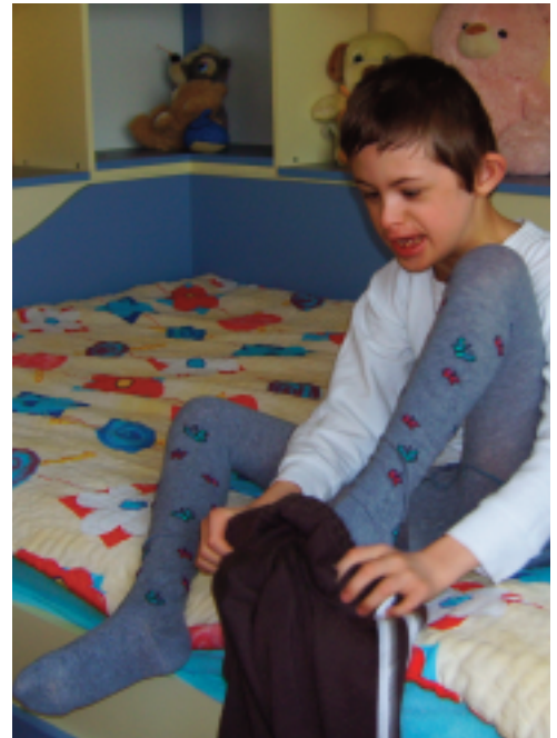
Argentina. • Korea. • Romania.